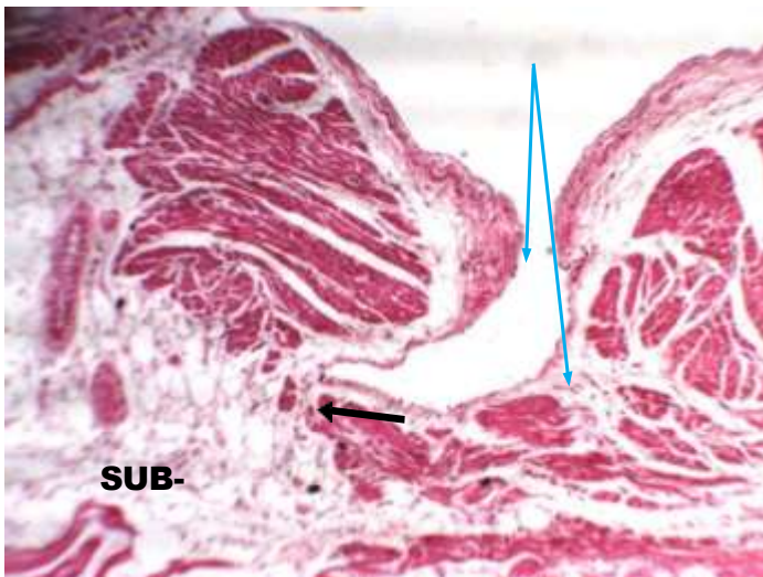
Fig.2: Photo showing sub-epicardial continuous with sub-endocardial tissue (black). Contrast between thick and thin endocardium (blue) (H & E)