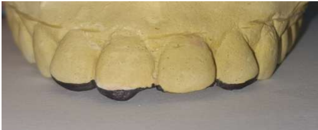
Fig 3. A black marker used to mark the area to be recontoured on the cast, helps in previsualisation of end result

Preoperative dimensions were recorded. A black marker was used to mark the area to be recontoured on the cast. (Fig 3).