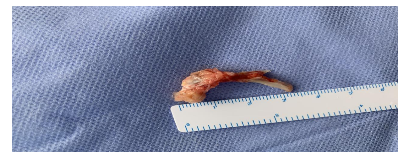
Figure (2): The excised cervical rib

ISSN: 0975-3583, 0976-2833 VOL 12, ISSUE 04, 2021