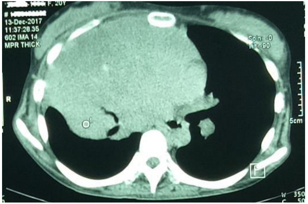
Figure 3: A thoracic CT image showing a right-lung solid mass.

Chest computerized tomography (CT) showed that there was a mass in the right anterior lung, a good bronchovascular streak, and no visible infiltrates or metastatic nodules in both lung fields. The trachea, carina, right and left main bronchi, aortic arch and aorta were all normal, and no pleural effusions were observed. The heart was pushed to the left, the mediastinal and hilar lymph nodes did not appear enlarged, the adrenal glands were not enlarged, and bones appeared to be intact. The diagnostic impression from the CT was a right lung solid mass pushing the heart to the left with T4NxMx staging (Figure 3).