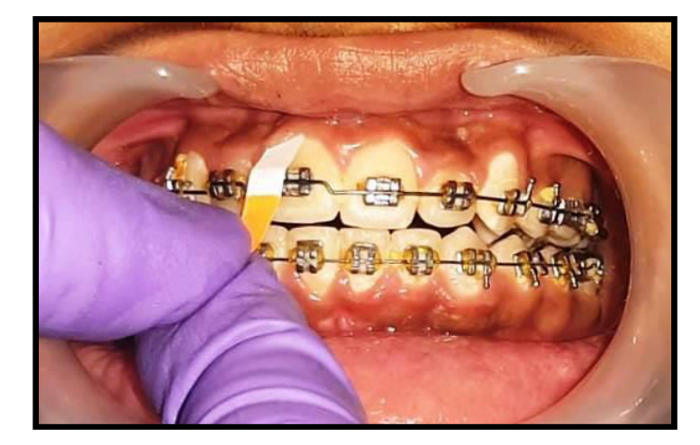
Figure 1: Gingival crevicular fluid collection at buccal surface of maxillary central incisors

nickel and chromium. On the day of gingival crevicular fluid collection, patients were asked to report in the morning appointment slot with no liquid drinksin breakfast. Patients were also advised to avoid any edible rich in nickel and chromium for one day before the follow up appointment. During collection procedure, any air water spray was avoided and tooth surface was dried smoothly and kept absolutely dry with cotton. Standardized Perio Paper was inserted at designated sites for one minute to absorb adequate fluid. Perio Paper (GCF Collection Strips) is a special paper strips that absorb fluid (Perio Paper; GCF Collection Strips, OraFlow Inc. Smithtown, Hewlett, NY, United States of America). Total four strips were used per patient per visit and stored carefully in glassware at freezing temperature. All strips were analyzed for levels of nickel and chromium (by spectrophotometer services at National Chemical Laboratory [NCL], Pune, India). Mean of all four strips per patient per visit was taken (in \mu g/gm )as final and sent for further analysis.